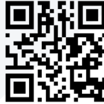
Demo Tour Video