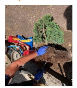
Remove excess dirt from plant.